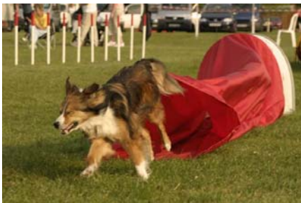
Can I open my eyes yet?

The day started very early. Some helpers had to be at the ground by 6.30 am. to help direct the competitors where to park their cars.