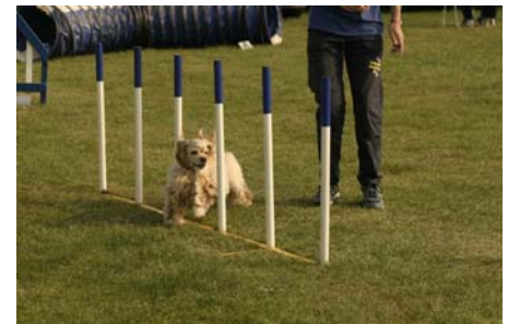
Am I as bendy as a Collie?

If you didn't go—why not? You missed a great day out and actually we needed all the help we could get—perhaps you will lend a hand next year? No agility experience required—just you and your willingness to 'muck in'.