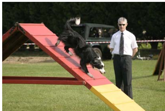
I must remember to tread on the yellow bit.