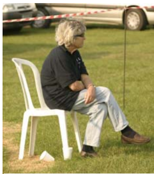
Our Chairman seems relaxed at the Agility Show. What was in those cups?

Cars and houses are left unlocked and everybody talks to everybody. The beaches are beautiful and the