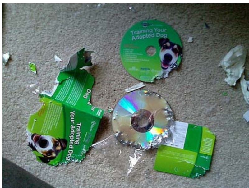
Training Your Adopted Dog!